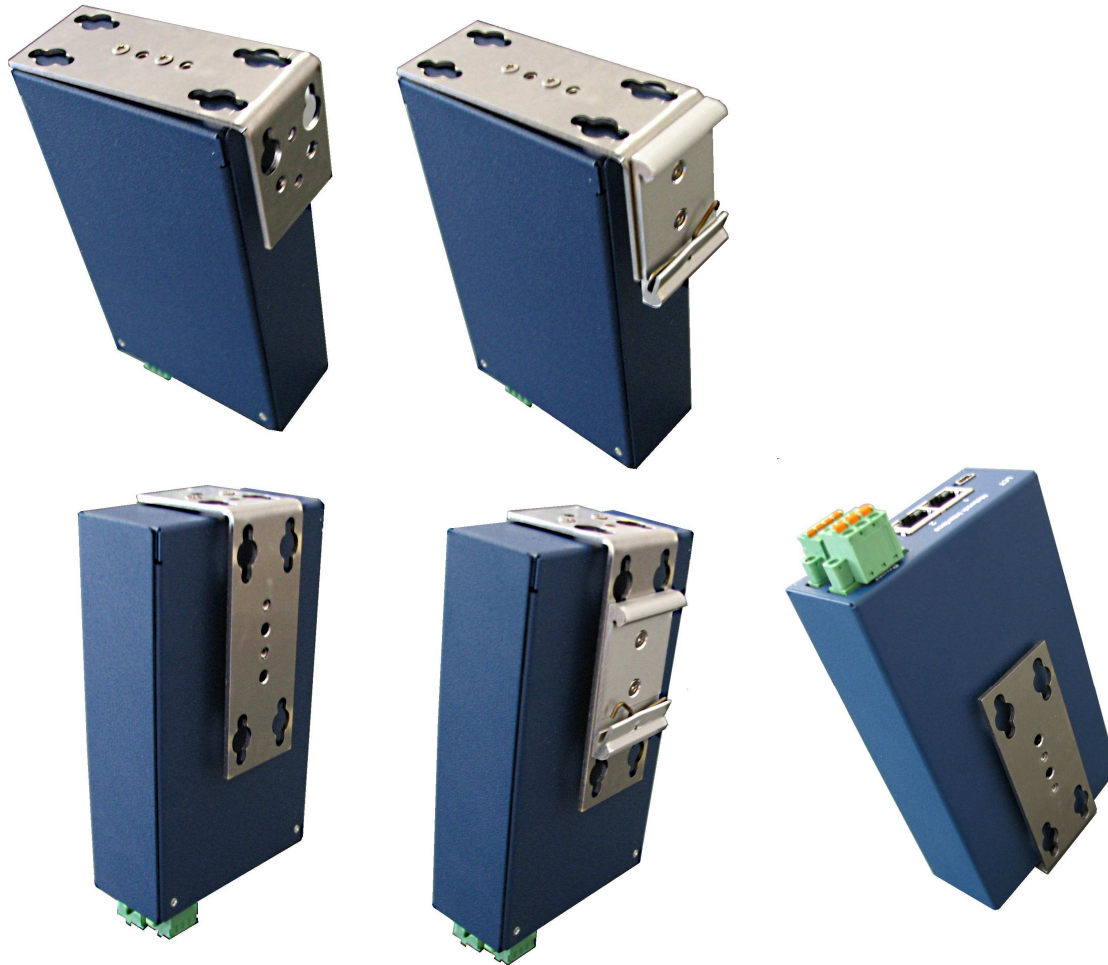
Figure 2.1. Comfortable Wallmount Clip for MiniFlex (Article: MF-RAILN-WALLMOUNT, V1).

For some applications it is needed to change the standard dinrail mounting. Here we show some examples, we are very open for special needs.