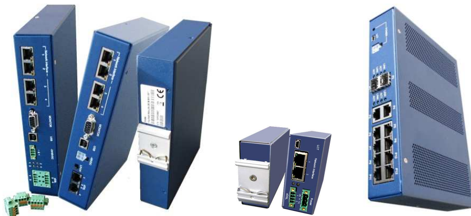
Figure 1.1. Orion2/3 and MiniFlex Dinrail Modems. MiniFlex Dinrail Switch.

The following pictures show the available dinrail mechanics in Orion2, Orion3 and MiniFlex series.